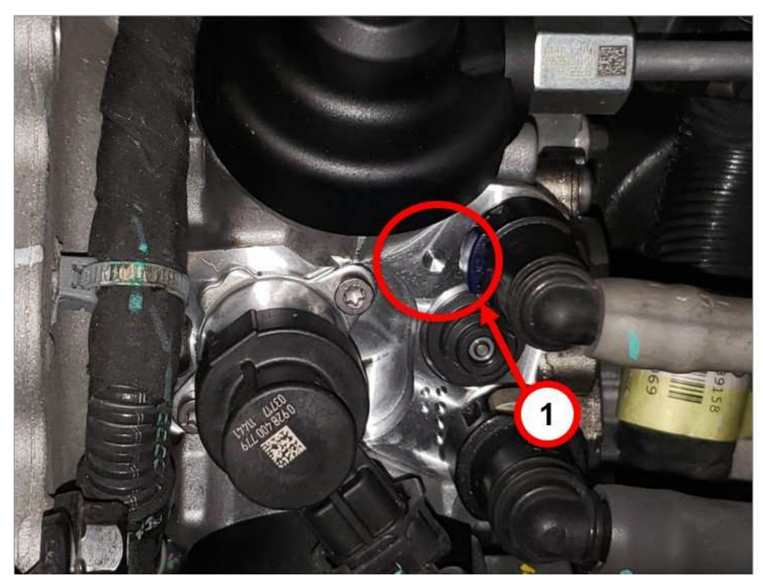
Fig. 1 New Style Symmetrical Cam Design Pump